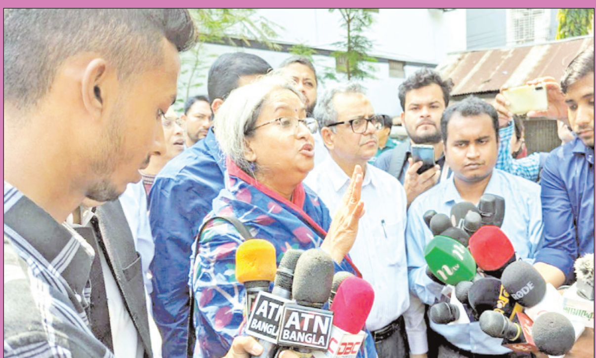
Education Minister Dr Dipu Moni speaking to reporters while visiting Badda High School on Sunday