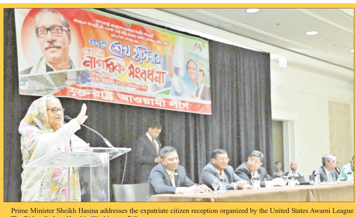
at The Ridge Carlton Hotel in Washington DC

"Bangladesh will march ahead and be transformed into a developed and prosperous country as dreamt by Father of the Nation Bangabandhu Sheikh Mujibur Rahman. We're working to materialise that dream," she said. The prime minister heavily came down on the BNP-Jamaat quarter for carrying out anti-state propaganda at home and abroad cashing in on Bangladesh."We've made Digital Bangladesh. They (BNP-Jamaat) are conducting propaganda against us using the tools of Digital Bangladesh. Don't pay heed to that propaganda," she added. The premier further reminded the countrymen that the independence of Bangladesh had been achieved in exchange for blood of millions, saying all development in the last 14 years ensuring and maintaining due