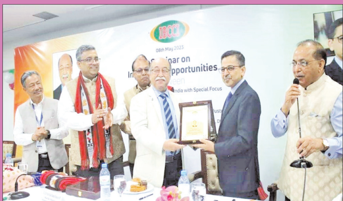
Indian High Commissioner to Bangladesh Pranay Verma in a seminar organized by FBCCI on "Investment Opportunities between North East India and Bangladesh"