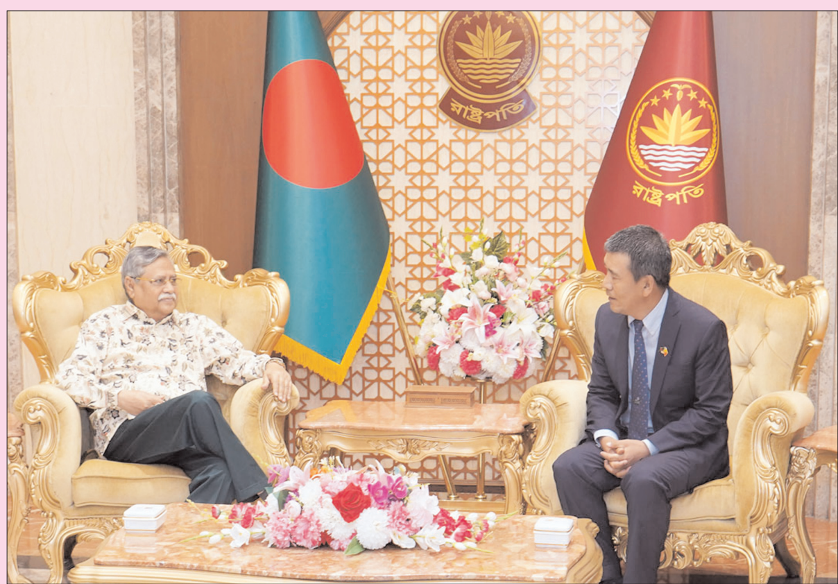
Bhutanese Ambassador to Bangladesh Rinchen Quentsil met President Sahabuddin on Tuesday at Bangabhaban.