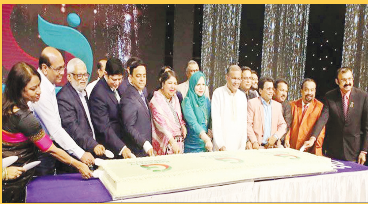
Speaker Dr. Shirin Sharmin Chowdhury inaugurated 'Green TV' by cutting a cake at Bashundhara International Convention City in the capital. Meanwhile, the Minister of Information and Broadcasting, Hasan Mahmud was present.