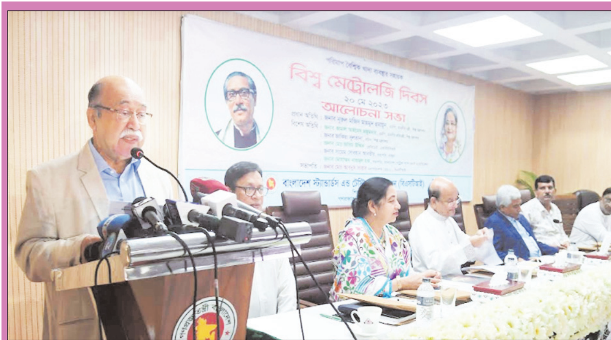
Industries Minister Nurul Majid Mahmood Humayun delivered the chief guest speech at the discussion meeting on the occasion of "World Metrology Day" at BSTI head office in Tezgaon, capital. State Minister for Industries Kamal Ahmed Majumder was present