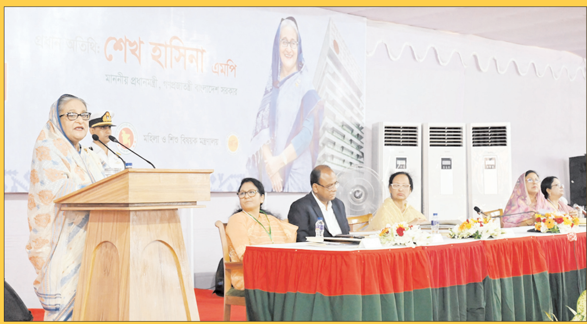
Prime Minister Sheikh Hasina addressed a gathering of the country's women entrepreneurs and Bangladesh Awami League women's organizations on the occasion of the inauguration of Joyita Tower at Ganabhaban on Tuesday

President to undergo surgery in Singapore tomorrow, seeks people's blessing