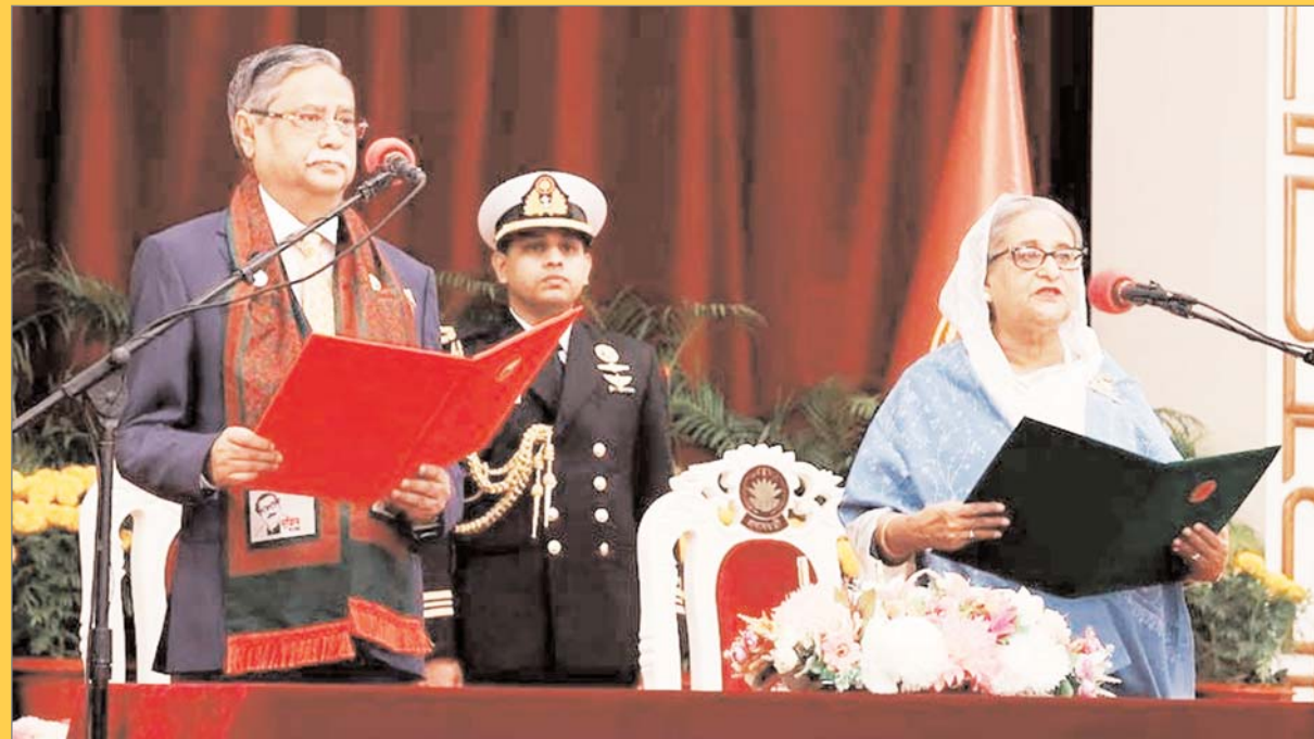
Awami League President Sheikh Hasina took oath as Prime Minister for the fifth time. Yesterday Thursday at 7 pm the President Shahabuddin recited the oath to Sheikh Hasina