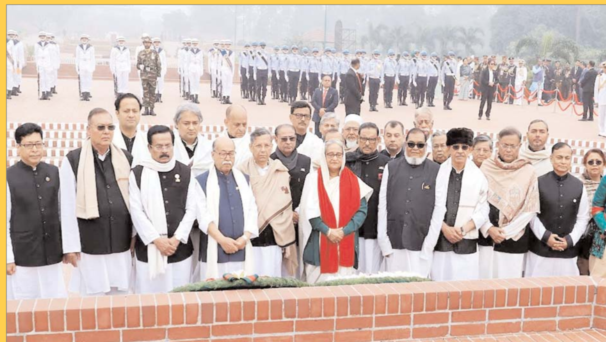
PM & Cabinet members pay homage to National Memorial at Savar, on the outskirts of the capital city Dhaka

lier in the morning paid homage to Father of the Nation Bangabandhu Sheikh Mujibur Rahman in Dhanmondi by placing wreaths at his portrait in front of Bangabandhu Bhaban in the capital. Bangabandhu's younger daughter and Prime Minister's younger sister Sheikh Rehana was present at that time. Sheikh Hasina took oath as the prime minister for the fifth term, fourth days after the Awami League secured a landslide victory in the 12th parliamentary election held on January 7, 2024. ▶▶ SEE PAGE-2