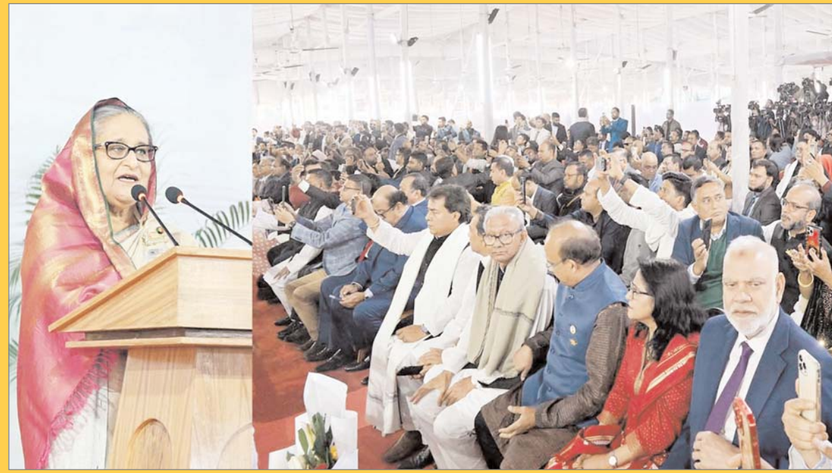
Yesterday Tuesday Prime Minister Sheikh Hasina addresses several hundred expatriate AL leaders from across the globe gathered at her official residence Ganabhaban