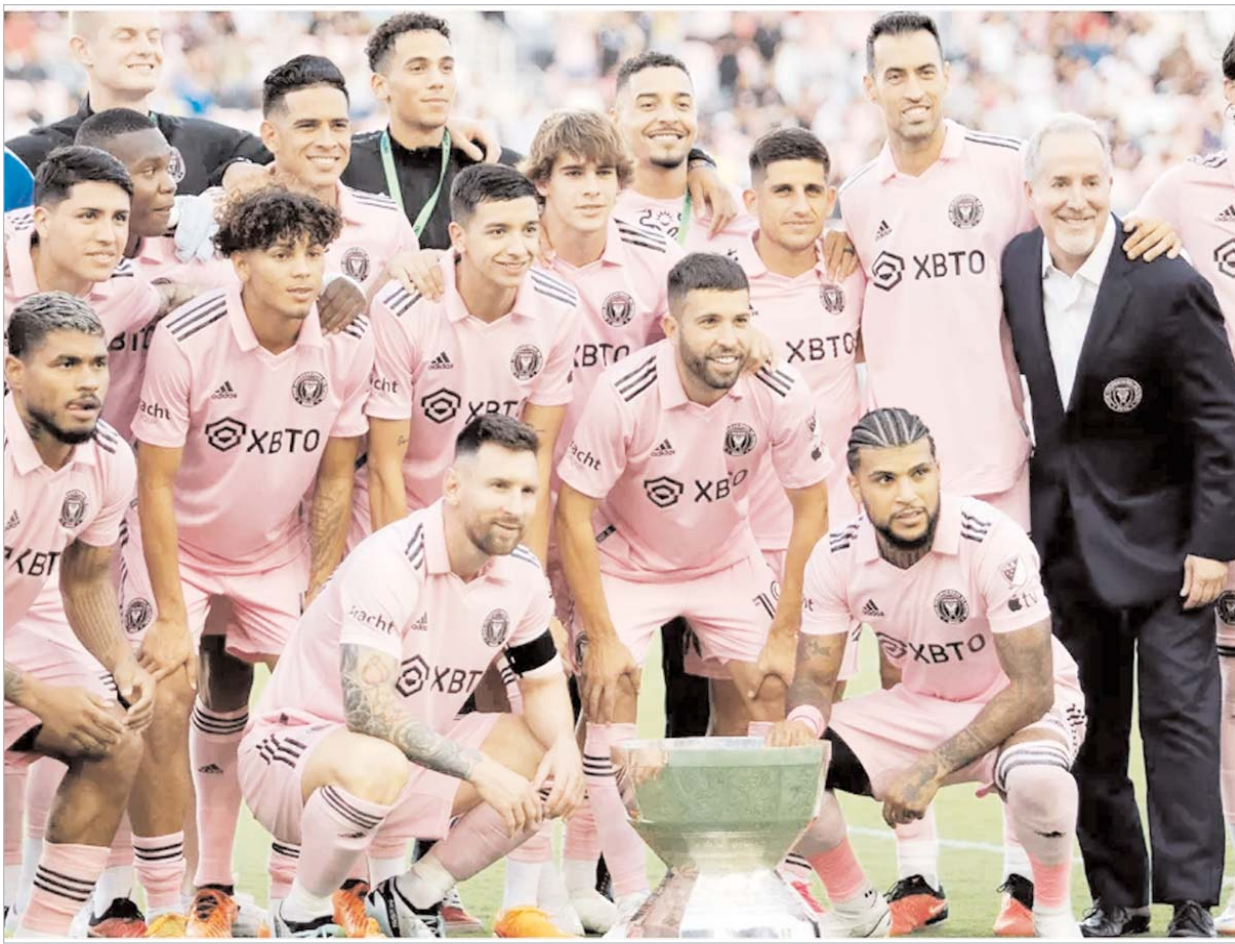
Lionel Messi (front row) helped Inter Miami beat Nashville SC to win the Leagues Cup in the United States