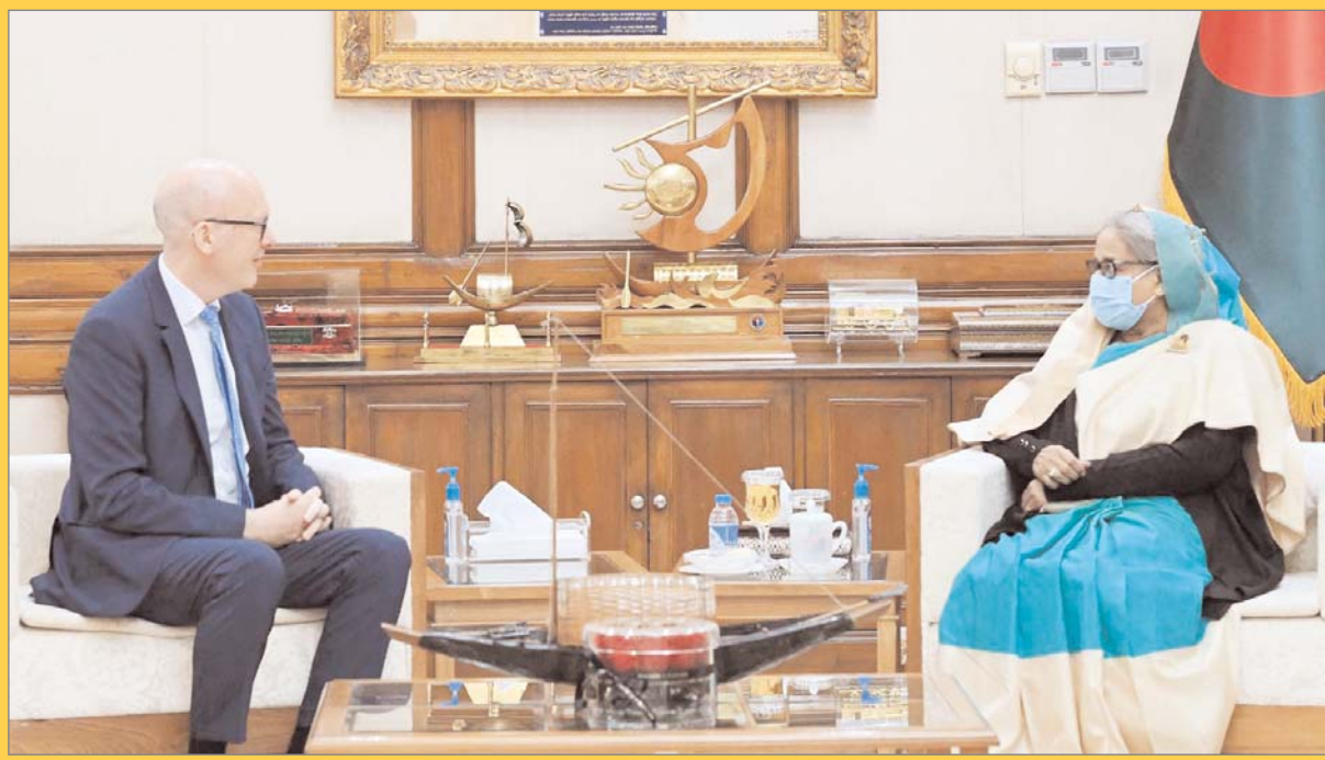
Yesterday Thursday European Union Ambassador to Bangladesh Charles Whiteley meets Prime Minister Sheikh Hasina at Ganabhaban