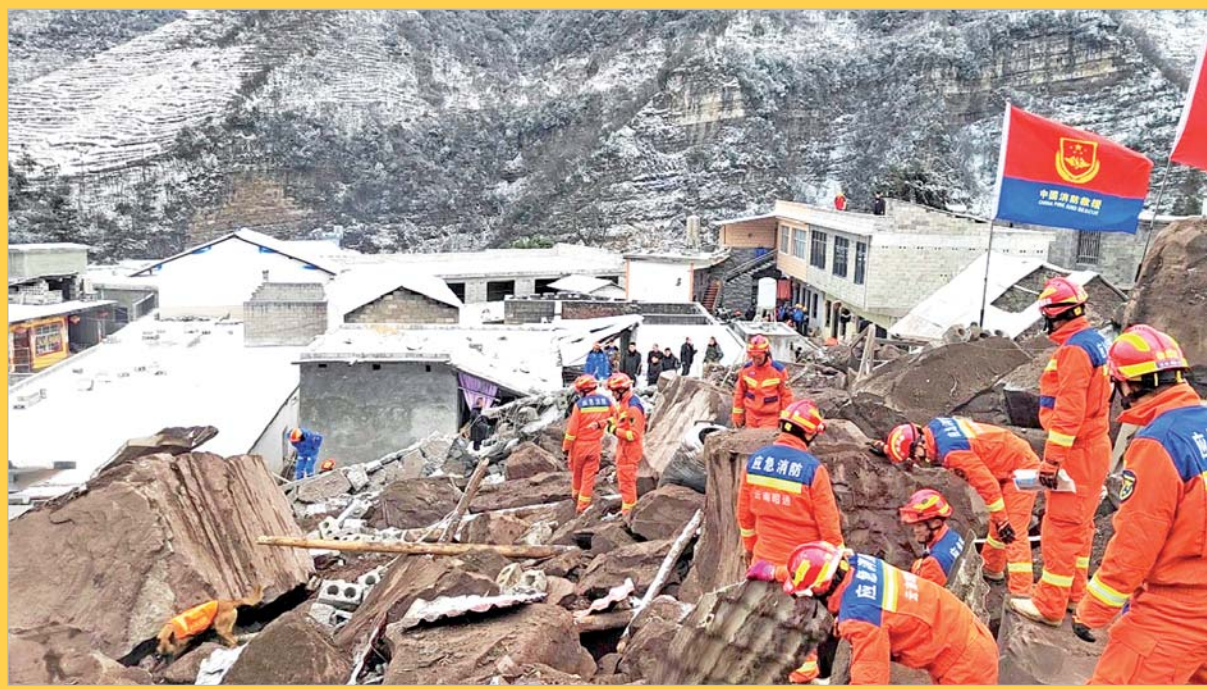
Rescuers working at the site of a landslide in Liangshui Village, Tangfang town in the city of Zhaotong, southwest China's Yunnan province on yesterday Monday