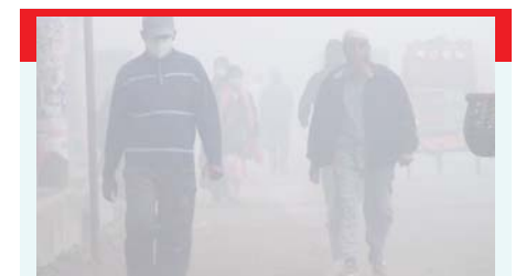
Dhaka records season's lowest temperature Yesterday Monday morning