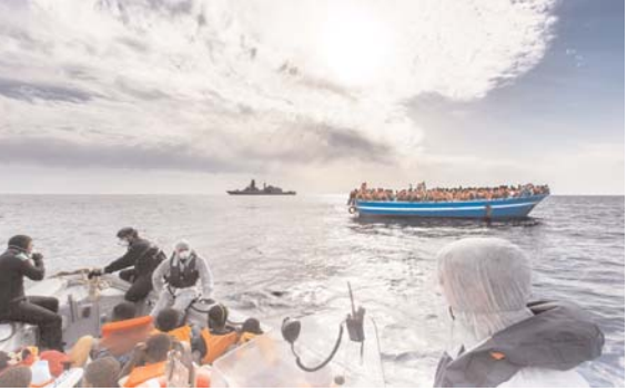
attempting the journey in 2023. This makes the Andaman Sea and Bay of calls on regional coastal authorities Saltmarsh on Yesterday Friday. The Bengal one of the deadliest stretches to take urgent action to prevent

over 200 more than in 2022. Survivors have shared horrifying based violence.