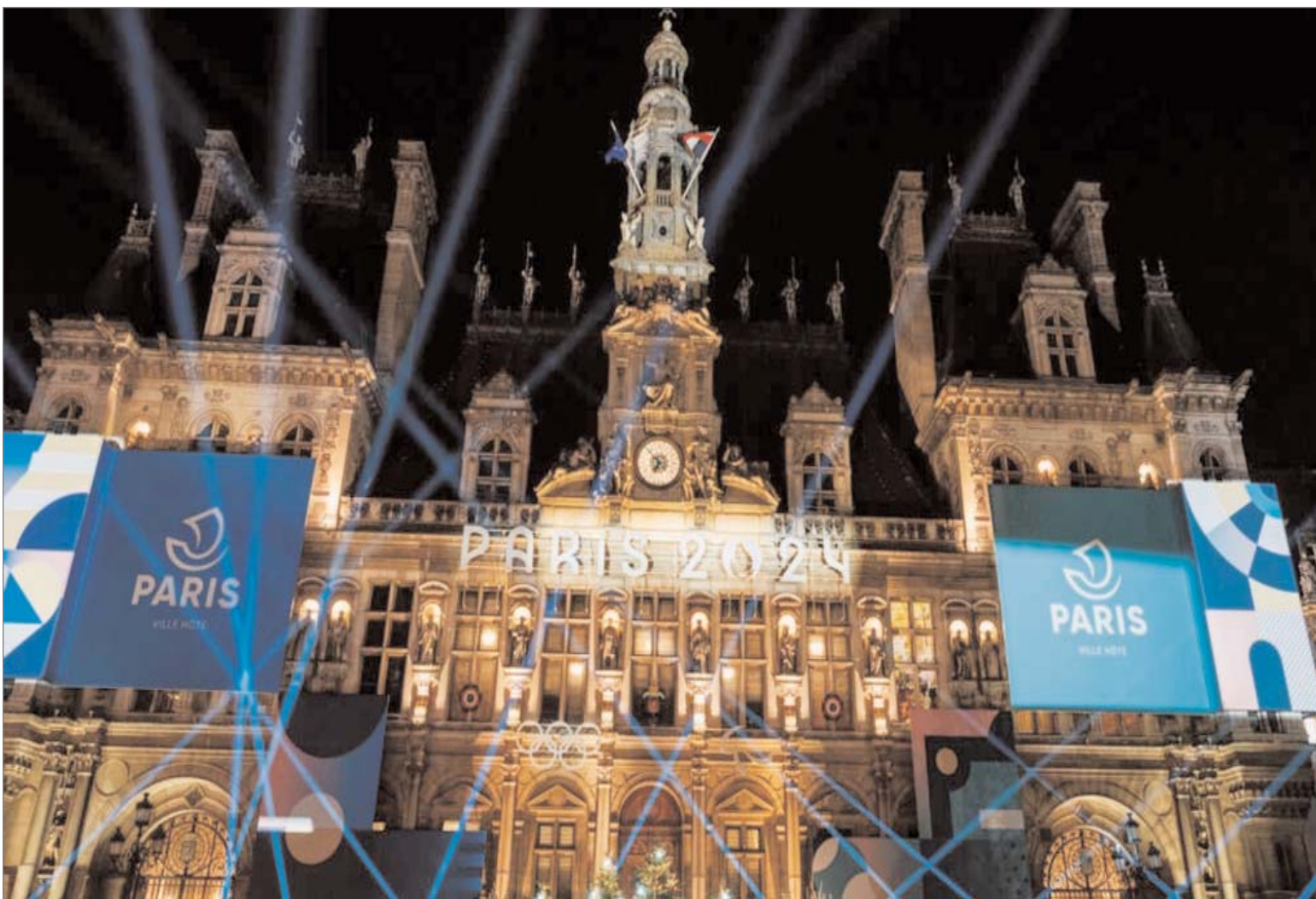
After two Covid-blighted Olympics, a successful Paris Games could revive the Olympic brand, a former IOC executive believes