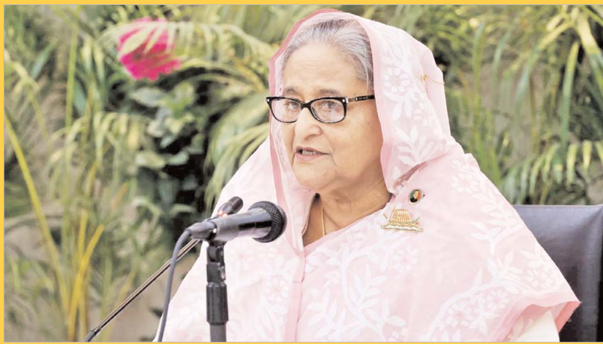
Prime Minister Sheikh Hasina speaks while chairing the Bangladesh Planning Commission meeting at its NEC conference room on Yesterday Wednesday

Chinese Vice Minister Sun Haiyan will meet PM Hasina on today