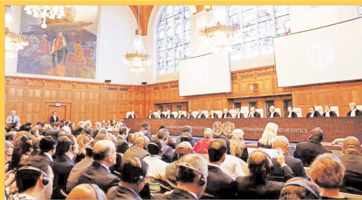
Judges at the International Court of Justice (ICJ) rule on emergency measures against Israel following accusations by South Africa that the Israeli military operation in Gaza is a state-led genocide, in The Hague, Netherlands, Yesterday Friday.