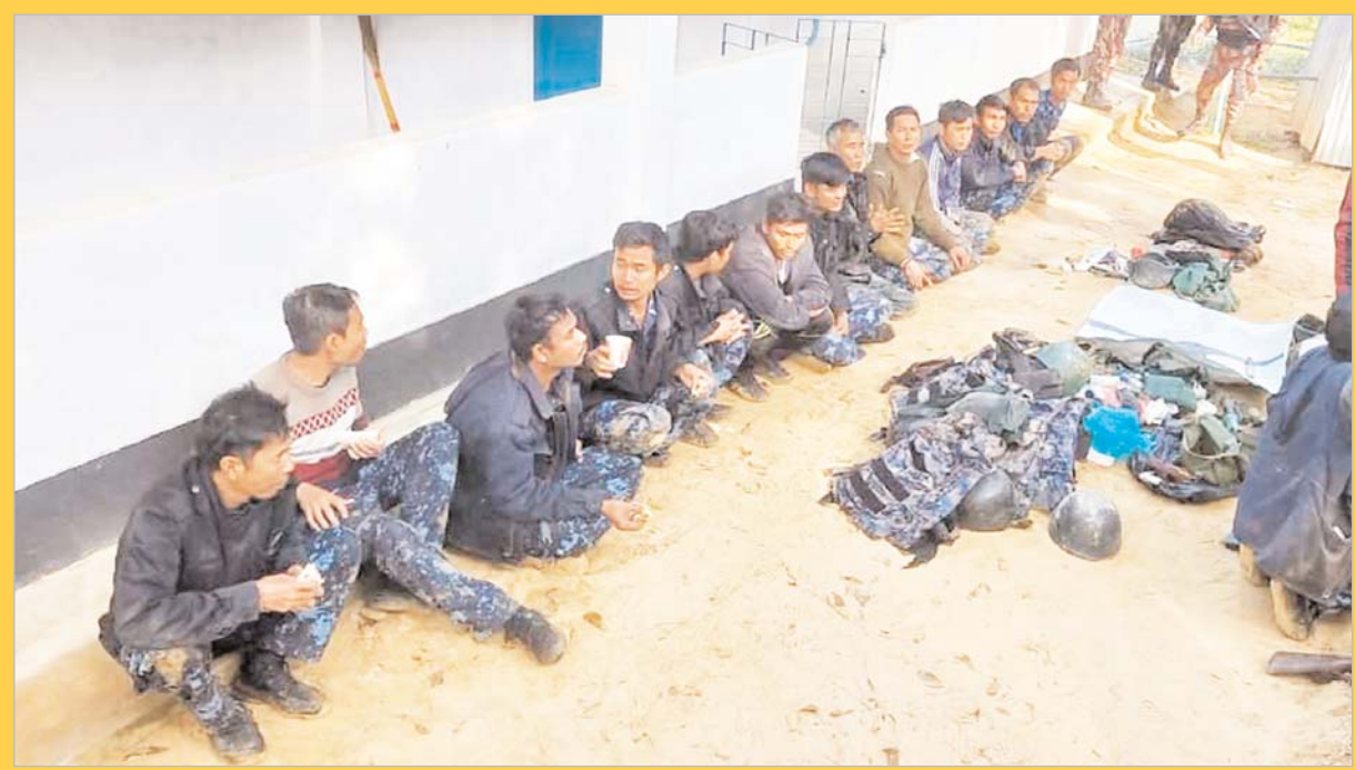
At least 14 personnel from Myanmar's Border Guard Police (BGP) fled to Bangladesh and took refuge in a Border Guard Bangladesh (BGB) outpost in Tormu, Bandarban after being attacked by rebels yesterday Sunday