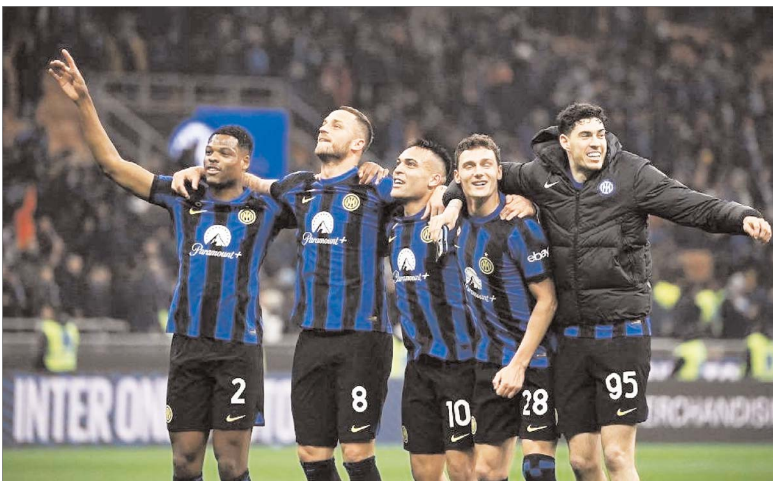
(From L) Inter Milan's Dutch defender #02 Denzel Dumfries, Austrian forward #08 Marko Arnautovic, Argentine forward #10 Lautaro Martinez, French defender #28 Benjamin Pavard and Italian defender #95 Alessandro Bastoni celebrate their team's 1-0 victory after winning the Serie A football match between Inter Milan and Juventus at the San Siro stadium in Milan