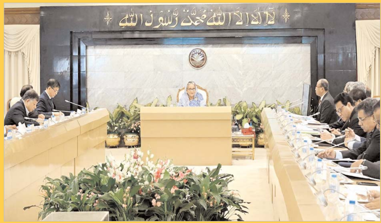
Yesterday Monday Prime Minister Sheikh Hasina chaired the secretary meeting at her office