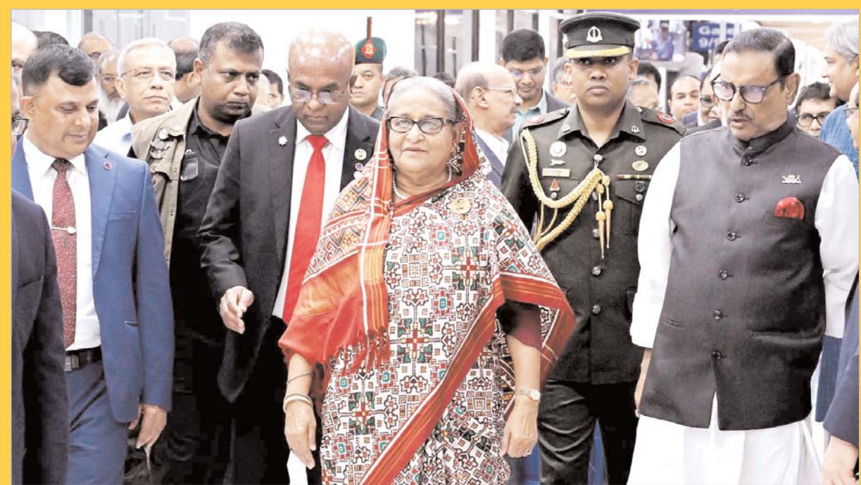
Prime Minister Sheikh Hasina was welcomed by cabinet members and senior officials when she arrived at Hazrat Shahjalal International Airport in Dhaka after her visit to China on Thursday

This has set a good example of friendly exchanges and mutually beneficial cooperation between countries, especially between Global South countries, Xi said. He said China is ready to take the 50th anniversary of diplomatic relations next year as an opportunity to deepen the high-quality cooperation under the Belt and Road Initiative (BRI), expand cooperation across the board in intensity and reach, and advance the sound and steady